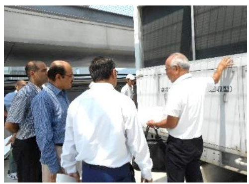
Visit to EHP facility (manufactured by Mayekawa MFG. Co., Ltd.) installed at Hyogo Prefectural Museum of Art

The visit to industrial sites, meeting in person with the technology providers and dialogue with Hyogo prefectural government were appreciated by the Indian delegates as well as the Japanese counterparts as precious opportunities of obtaining reference and network for their future activities through direct interaction and understanding of current situation under the JITMAP.