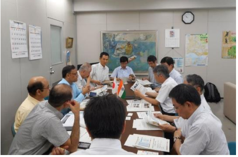
Meeting with Hyogo Prefectural Government

Following the visit for EHP, they visited TLV International, INC. in Kakogawa city to interact with TLV's experts and learn more about Steam System Optimization Programme (SSOP). Followed by their factory visit, IGES, TERI, and GITCO discussed with TLV about potential sectors and areas to introduce the SSOP in India.