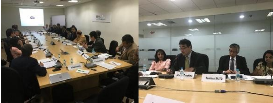
2nd Dialogue meeting

Under the Mission, the 2 nd Dialogue meeting for JITMAP was organized at Pune on 18 th January 2018, along with feasibility studies for energy efficient belt technologies in the Indian dairy and auto component industries. The 2nd Dialogue meeting was attended by key stakeholders from Gujarat (GEDA,GITCO), Maharashtra (MEDA,MCCIA),and representatives from the Indian and Japanese industries.