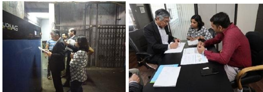
Feasibility study at Eagle Fibres, Surat