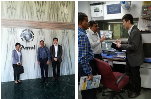
Feasibility study at Amul group, Ahmedabad